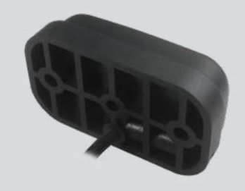
Flat surface mounting grommet supplied as standard with each lamp